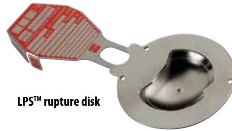
LPS™ rupture disk

The LPS rupture disk was developed to provide low burst pressures from 5 psig (0.35 barg) using reverse buckling rupture disk technology. The LPS rupture disk, combined with the SRB-7RS® safety head, provides accuracy and reliability. The LPS uses SAF™ technology enabling very low burst pressures to be achieved with excellent opening characteristics.