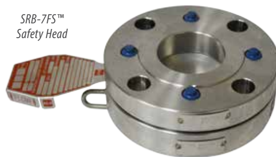
SRB-7FS™ Safety Head

Note: Optional tell tale connection in safety head outlet will be required to meet ASME and PED code requirements when downstream devices are present.