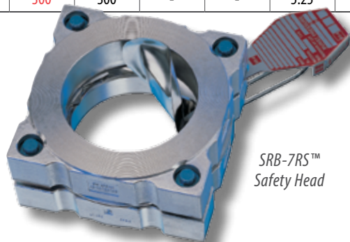
SRB-7RS™ Safety Head

The SRB-7RS is the industry standard pre-torqued holder which ensures proper clamping of a rupture disk before installation between companion flanges.