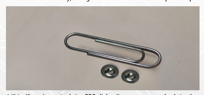
1/8 in (3mm) nominal size FRB disk adjacent to a standard sized paper clip.

BS&B focused R&D attention to miniaturizing the most advanced rupture disk designs that have long benefited the chemical process industry. Harnessing the use of shapes and structures to resist normal operating pressure and temperature conditions, the FRB, QRB and MRB rupture disks respond by opening with millisecond speed at the desired burst pressure providing the equipment designer with 'reverse buckling' disk superior performance.