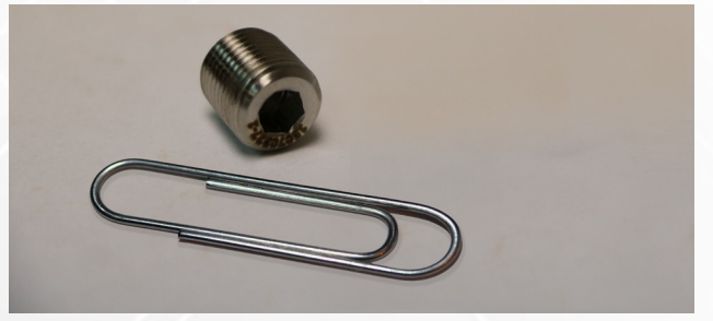
1/8 in (3mm) nominal size welded FRB assembly adjacent to a