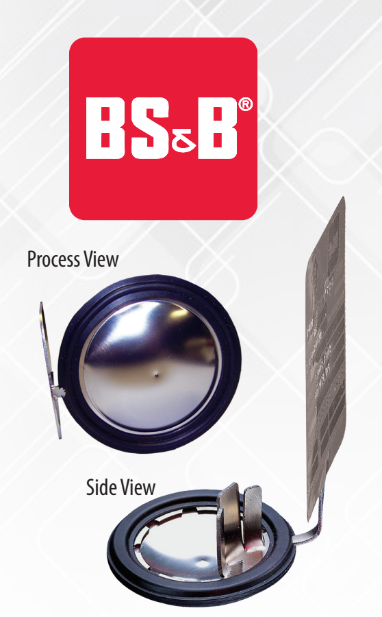
US Patents 5,996,605 and 6,178,983 apply; International patents pending.