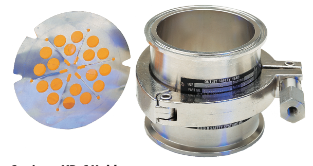
Sanitary VB-C Holder

The P/AVB-ST disk is an inverted form of the type AVB-ST disk and satisfies the medium range of overpressure and vacuum relief requirements that cannot be met by the P/VKB disk. Temperature range minimum -40°F (-40°C), maximum 400°F (204°C). Other sizes and material available on request. The construction of the disk may not be suitable for all sanitary applications; consult BS&B